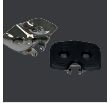
Roller seats made of polyurethane or carbon with six ball bearings for smooth, quiet running on the roller rail.