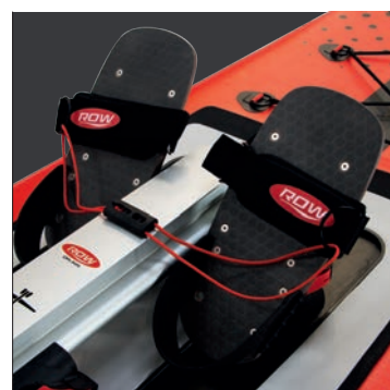
Foot stretcher with pivot axle: no overstretching of the Achilles tendon.